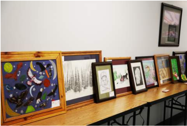
12/1: Art students displayed class projects in Ash Flat.