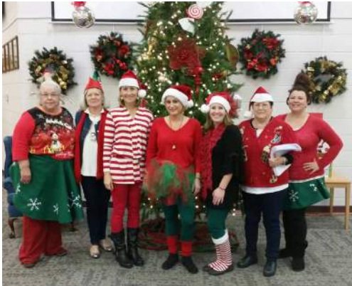
Pictured left, some of Santa's helpers, elves and whos anticipate the arrival of children at Holidays in Who-ville on 12/5.