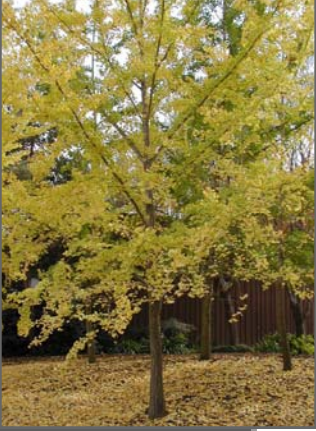
Photo of a Ginkgo tree in the Fall.