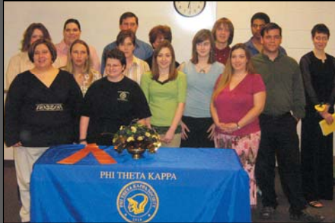
New members of Phi Theta Kappa

Ozarka College's Beta Alpha Eta chapter of Phi Theta Kappa (PTK), a national honor society for students in two-year colleges, inducted new members during its Induction Ceremony, held Thursday evening, March 8, 2007.